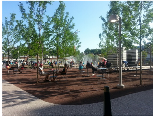
Penrose Square (C)