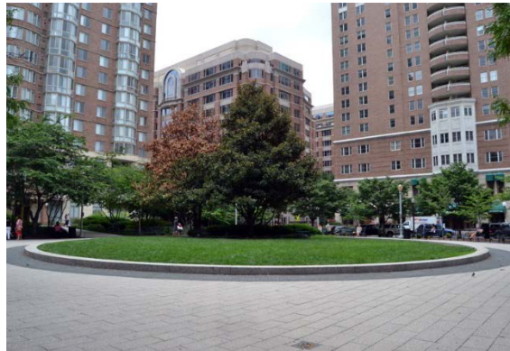
Welburn Square (NC)