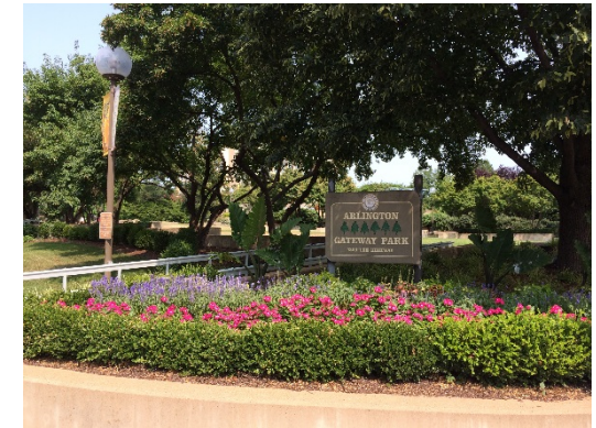
Gateway Park (NC)