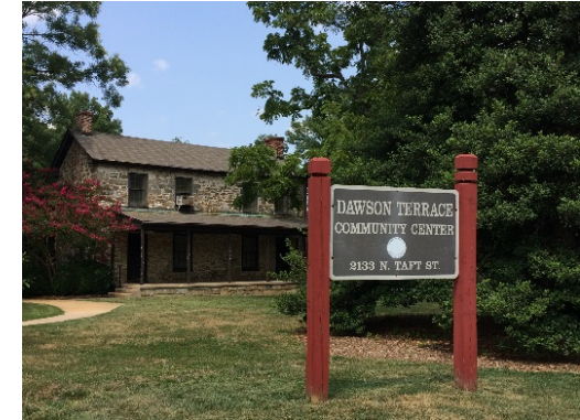
Dawson Terrace Community Center