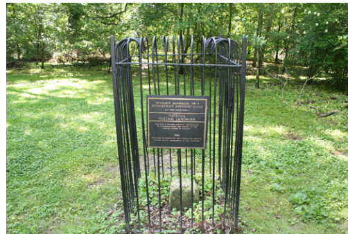
Benjamin Banneker Park: Boundary Stone