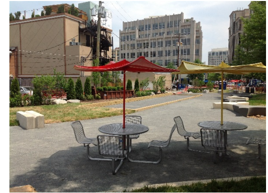
Clarendon-Barton Interim Open Space (NC)