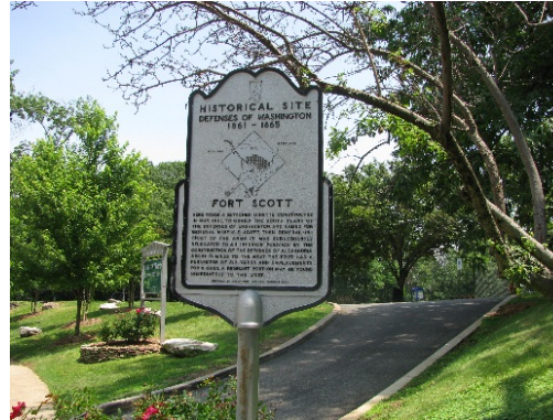
Fort Scott Park